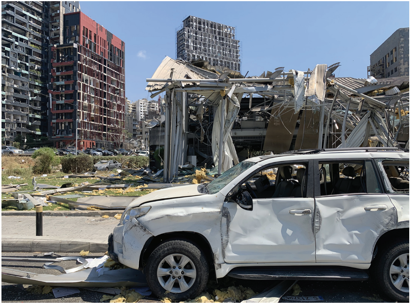
Above: A car stranded in front of what used to be the Audi showroom. In the left you can make out the damaged remains of both LIV and Skyline.